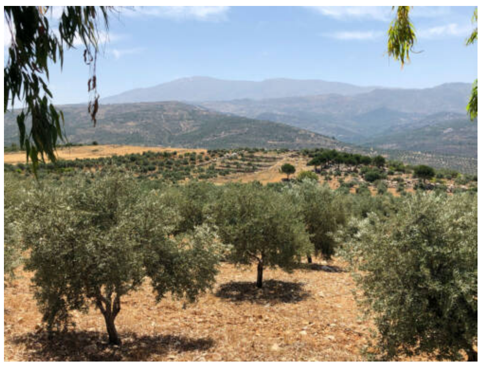
Some of the many olive groves across southern Lebanon.

Through our partners, I see flickers of light and life in the midst of relentless destruction—a counterpoint to the lament I feel. A space of grace opens in my spirit to join the Psalmist in that profound declaration of faith: "But I trust in your unfailing love; my heart rejoices in your salvation. I will sing the Lord's praise, for he has been good to me (Psalm 13:5-6)."