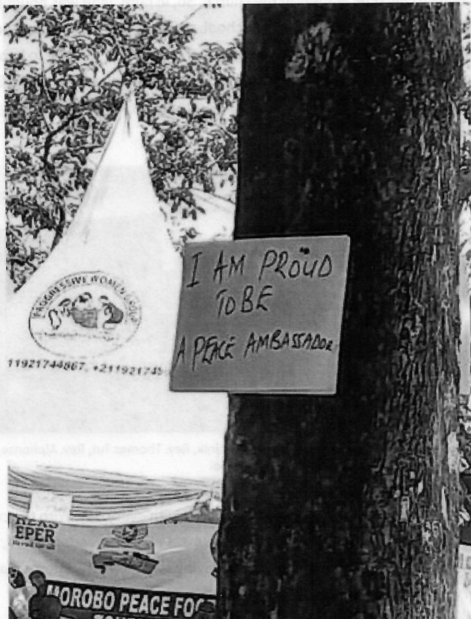
Sign at the RECONCILE celebration