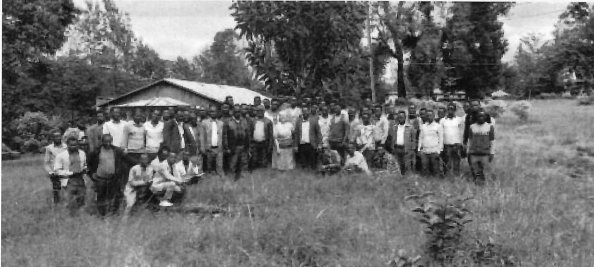
Students and staff at the Charles Haspel's Bible School in Mizan Teferi, Ethiopia

I am always so blessed each time I visit partners in the Horn of Africa. On my last trip in October-November 2023, I was struck by the way each partner is stepping out in faith in different, and yet similar ways.